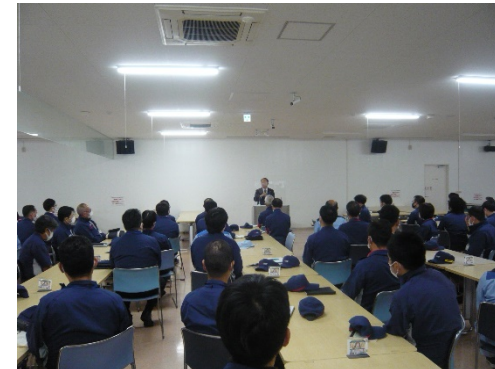
◇ Sanda Works (October 27, 2021)