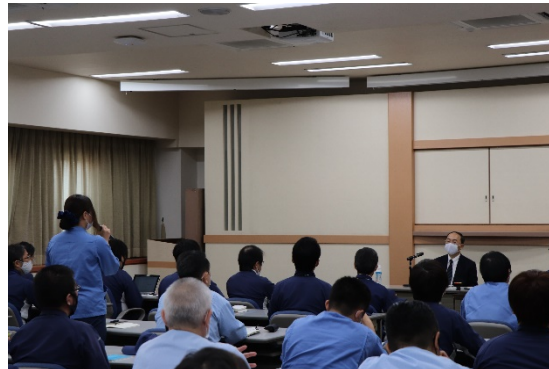
◇ Power Distribution Systems Center (October 6, 2021)